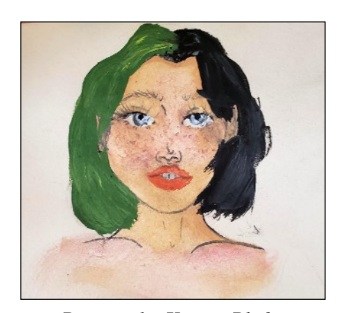
Portrait by Kenzie Phifer

I've used charcoal, watercolor, acrylic, and oil paints before and I don't really have a preference because it really just depends on my mood. For example, sometimes I want to make something soft and a little messy, so I'll use watercolors. Sometimes I don't want to worry about color, but I want to use more shading, so I'll use charcoal.