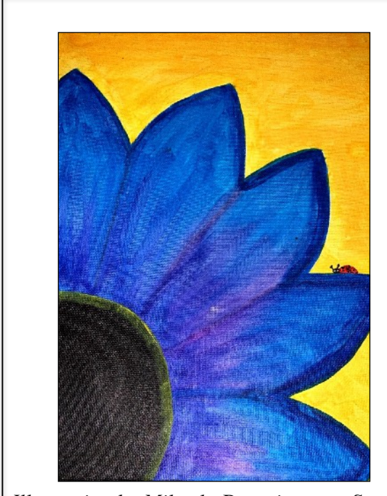
Illustration by Mikayla Desruisseaux, Sanford

I'm mentally happier - ready, put together, ready to go - when I do self-care.