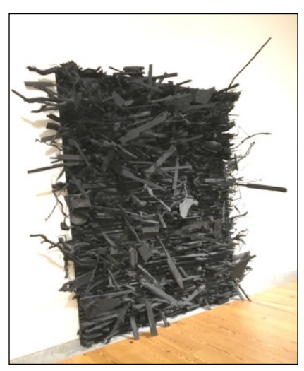
Leonardo Drew, Number 139 Portland Museum of Art

Number 139 permanently resides at the Portland Museum of Art in Portland, Maine. Number 139 is made out of hundreds of twigs, wooden slabs, wedges, blocks and chunks.