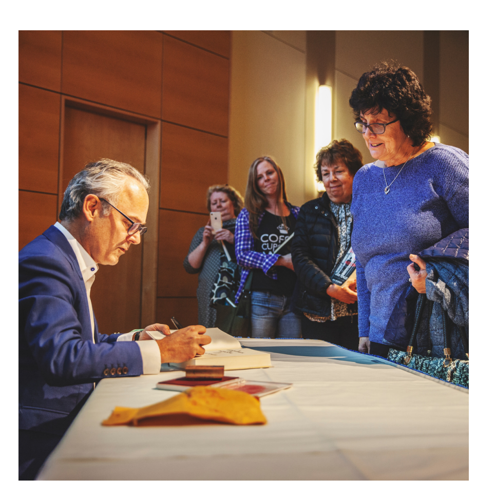
Wayfinder Schools' Author Event