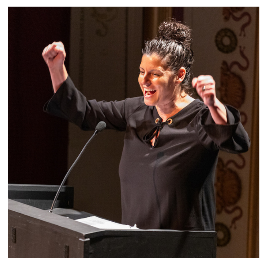
4th Annual Finding Our Way, Moth-Style Storytelling